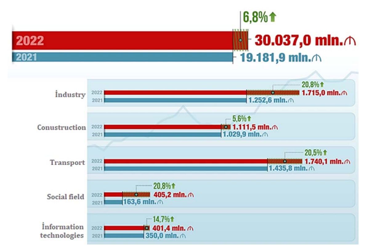
Figure 1. TAX revenue for non-oil and gas sector (in million manats)